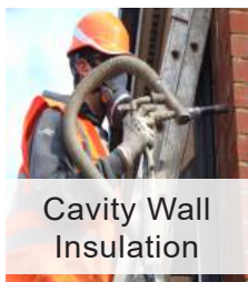
Cavity Wall Insulation

This scheme provides energy saving measures such as: