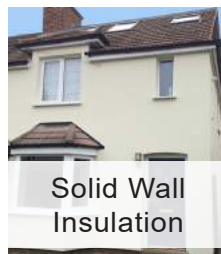
Solid Wall Insulation