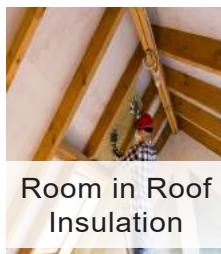
Room in Roof Insulation